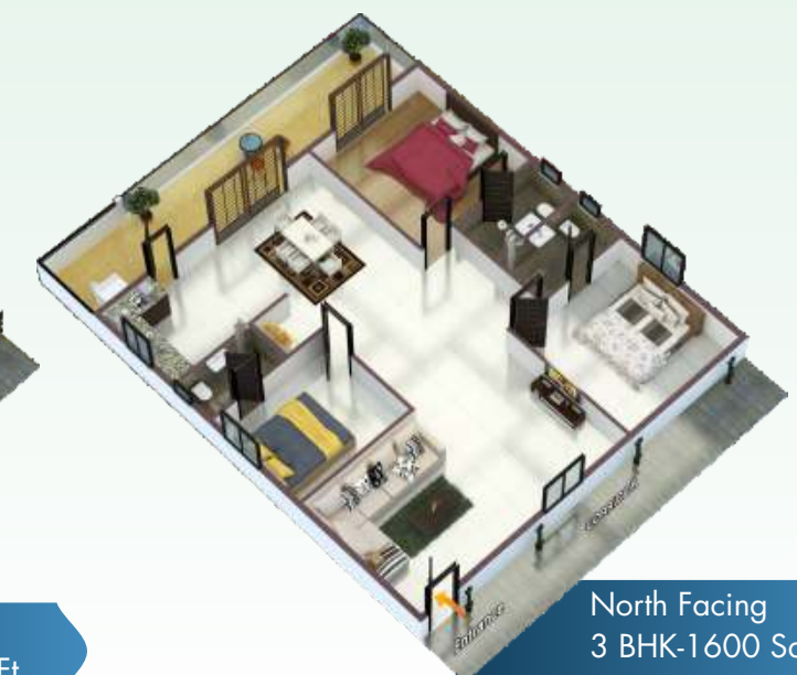
North Facing 3 BHK-1600 Sq.Ft