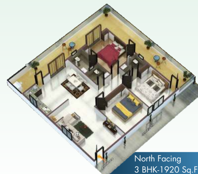
North Facing 3 BHK-1920 Sq.Ft