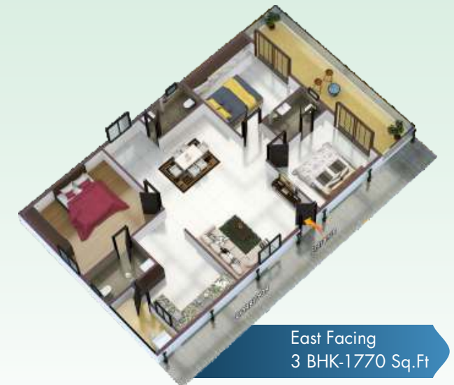
East Facing 3 BHK-1770 Sq.Ft