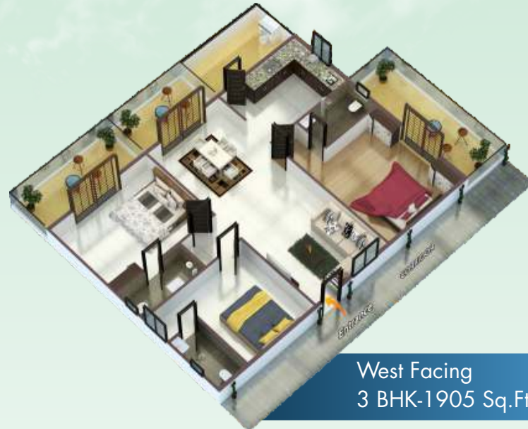
West Facing 3 BHK-1905 Sq.Ft