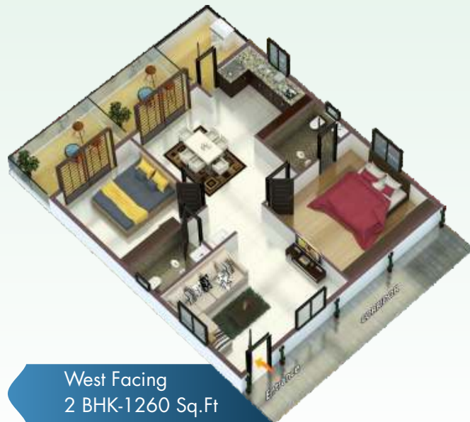
West Facing 2 BHK-1260 Sq.Ft