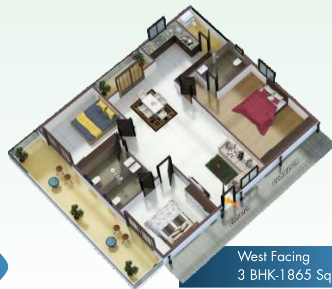
West Facing 3 BHK-1865 Sq.Ft