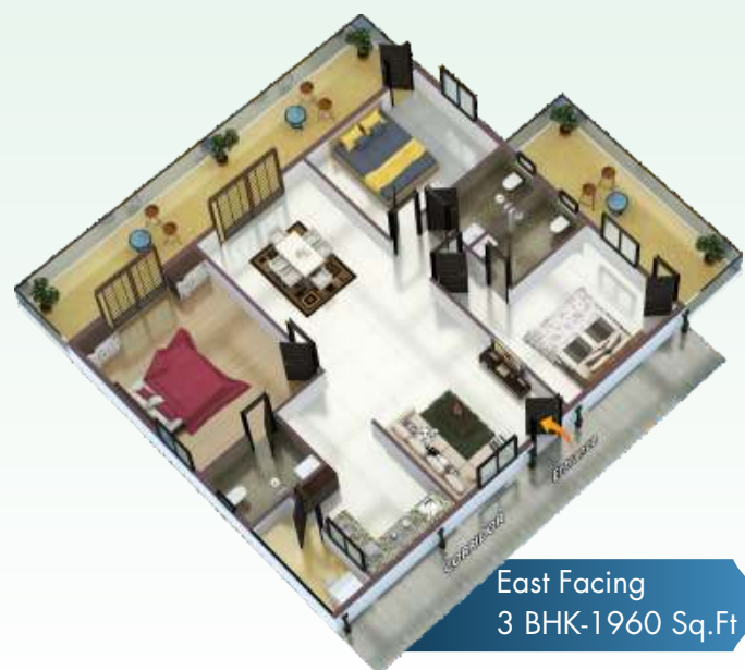
East Facing 3 BHK-1960 Sq.Ft