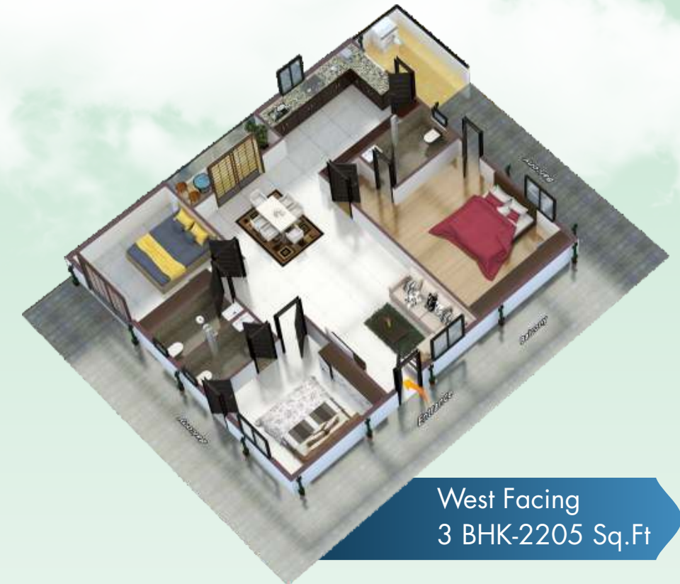
West Facing 3 BHK-2205 Sq.Ft