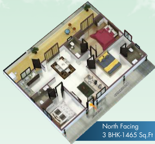
North Facing 3 BHK-1465 Sq.Ft

Experience UNLIMITED space like never before