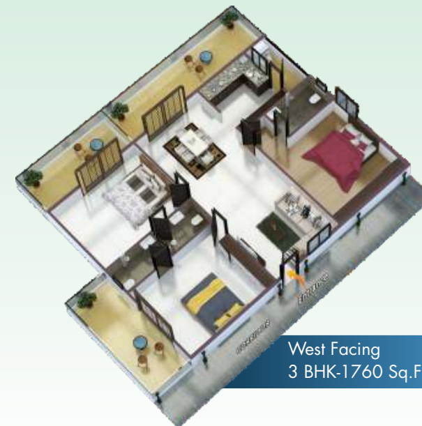
West Facing 3 BHK-1760 Sq.Ft