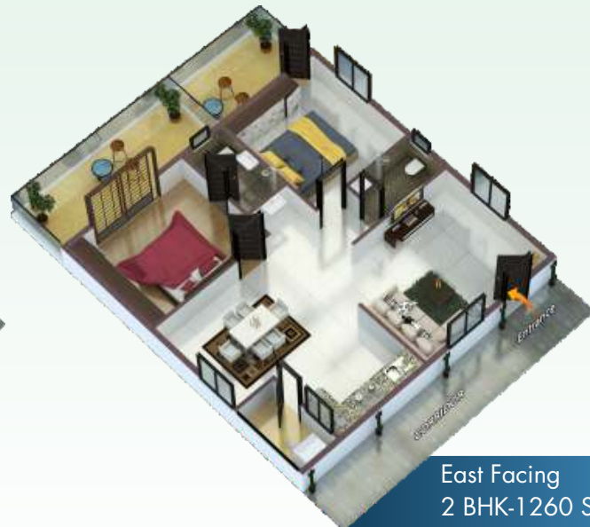
East Facing 2 BHK-1260 Sq.Ft